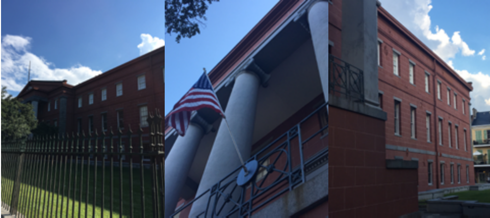
The Historic New Orleans Mint

The New Orleans Mint facility struck gold coins from 1838 to 1909 and struck far fewer coins than main Mint in Philadelphia. Today, this makes New Orleans minted gold coins dramatically more rare than their Philadelphia counterparts.